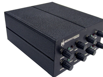
Model FO-SR-4 (4-channel bench-top enclosure)