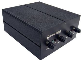
Model FO-SR-2 (2-channel bench-top enclosure)